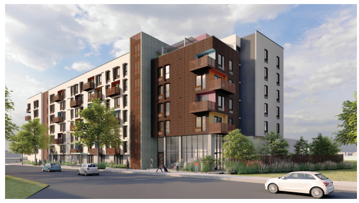
551 Keyes Street - property exterior when completed

The second floor offers a laundry facility, a large outdoor courtyard and barbecue grills for residents to enjoy. A rooftop terrace overlooks Alum Rock Avenue. The project will integrate a street-facing mural to enhance its overall vibrancy and the surrounding neighborhood.