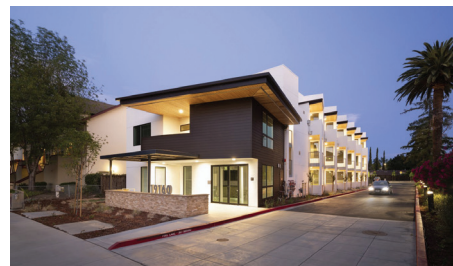
Catholic Charities and Charities Housing opened The Veranda in Cupertino in 2019