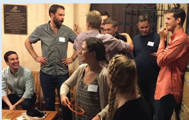
One of the highlights of the evening was the Ring Toss game.