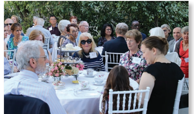
Longtime supporters of Catholic Charities' Circle of Hope enjoy each other's company at the Bishop's Tea.