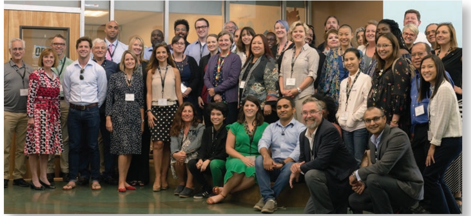
Bay Area social entrepreneurs attended the San Francisco Bay Area GSBI® Boost, which was sponsored by Catholic Charities and the Miller Center.